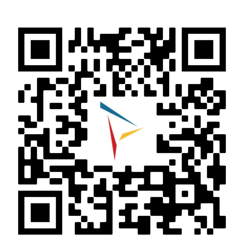
To learn more scan here