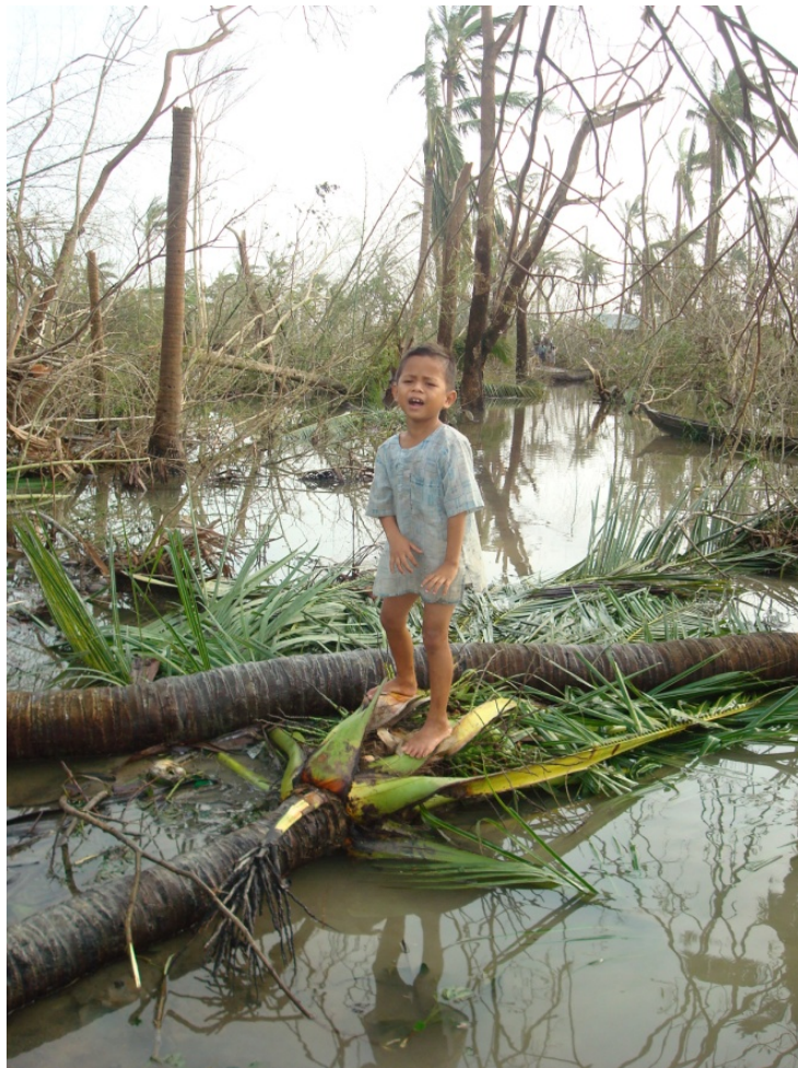
Boy in Mya Ba Go village, Bogale Township in the Delta