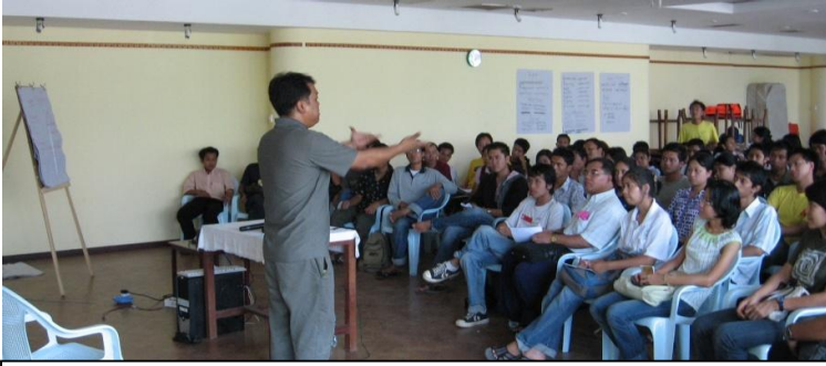
Training for volunteer helpers at Myanmar Egress

During the first 2 days it was difficult to get any data, as e-mails, internet, phonelines etc were mostly out of order. Soon many people came and asked where they could help and several experts were asked how to start and organize the help which is urgently needed. Some local organizations still have no