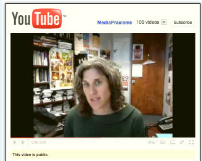
JUHASZ, LEARNING FROM YOUTUBE, 2008