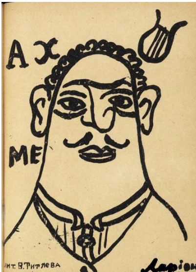
Mikhail Larionov, Portrait of Akhmet, Velimir Khlebnikov and Alexei Kruchenykh, Mirskontsa (Worldbackwards) (Moscow, 1912).