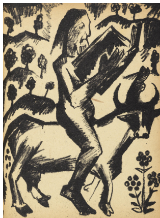
Natalia Goncharova, Hermit, in Alexei Kruchenykh, Pustynniki; Pustynnitsa: Dve poemy (Hermits; Hermitess: Two Poems) (Moscow, 1913). Research Library, The Getty Research Institute (88-B26127)

1200 Getty Center Drive, Suite 1100 Los Angeles, CA 90049-1688 Tel 310 440 7335 www.getty.edu