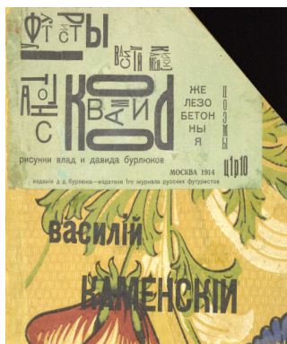
Vasily Kamensky, Detail of Tango s korovami: Zhelezobetonnyia poemy (Tango with cows: Ferro-concrete poems) (Moscow, 1914). Research Library, The Getty Research Institute (2567-605)