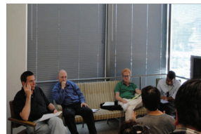
Faculty observe and offer advice to students as they prepare.