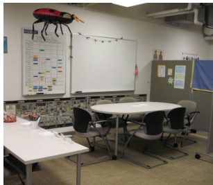
Conference/Work Group Study Area

If you haven't done so already, please come visit us at our new location, 1315 Pierce Hall. For our weekly office hours, please visit smi.ucr.edu .