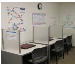
Technology Work Stations